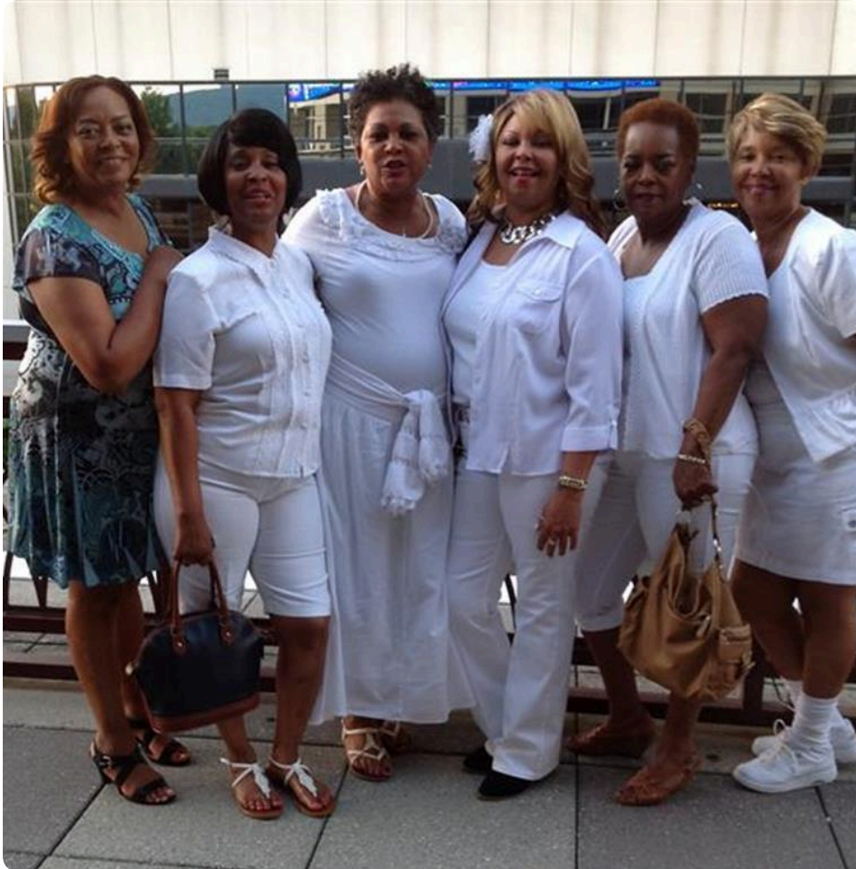
We miss you already and will see you soon